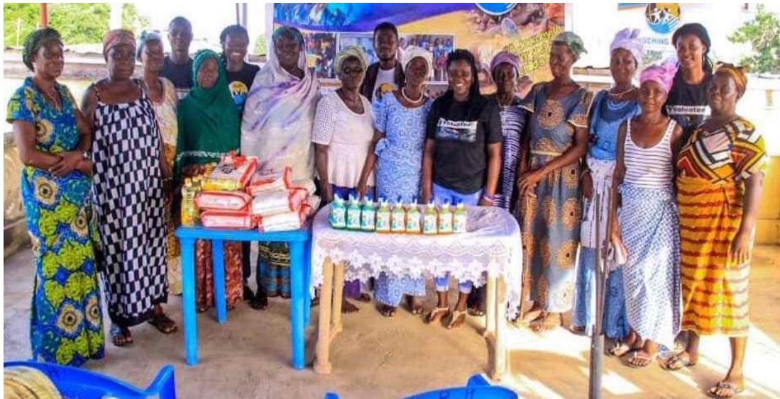
A group picture of the aged in attendance ▲

entrepreneurship skills and also taken through to a health talk session focusing on the best hygienic practices for healthier living.