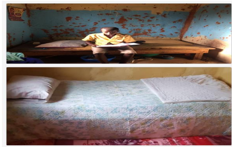
Before and after pictures of the renovated home. ▲

In an effort to improve living conditions at the home of beneficiary family (Ashileys), Touching Lives Outreach International put together resources to renovate and donate a number of items to the family at Weija. The family's home was in a deplorable state with worn-out walls and floor which prompted our decision to give the home a facelift. Work started with the restoration of the worn-out floor through plastering. The walls were also plastered over and repainted. In addition, floor carpets, three (3) student-sized mattresses, blankets, bedspread and sheet were donated to the family.