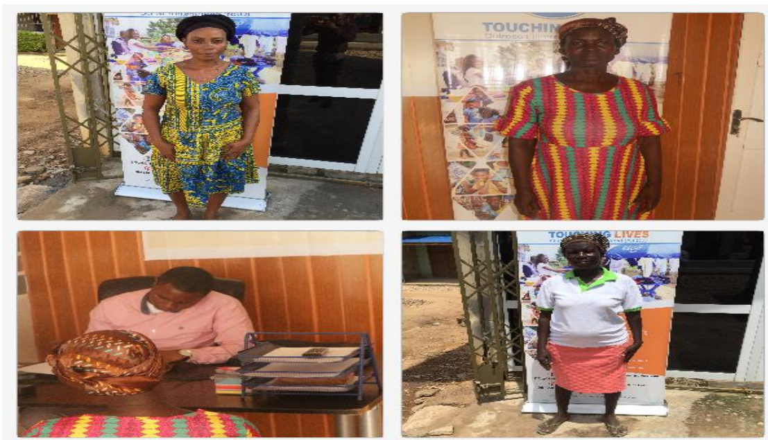
Some applicants for the Women Empowerment Fund ▲

TLOIN started screening over 100 potential beneficiaries in rural parts of Weija, Kwei and Kwao Bondzie through interviews and background checks which focused on their current financial situation, living conditions of themselves and their dependents, business plans among others.