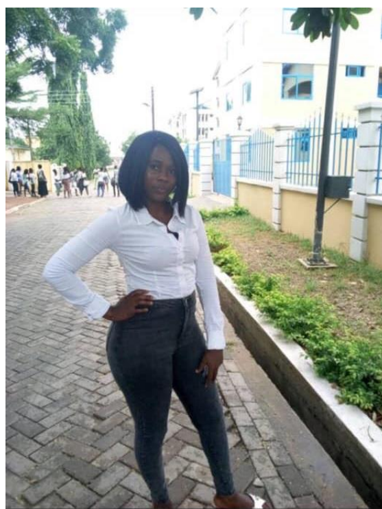
After Accra Technical University

I would like to thank them for their immense support for me and also promise them that I would do my best to achieve a higher height in my life.